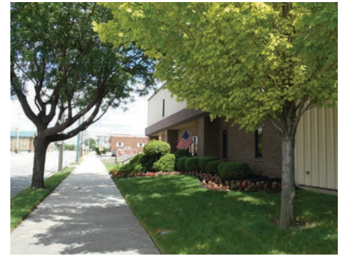
1222 E. Third St. (Miami Valley Gasket)

Last presented in the 1980s, the City Beautiful Award encourages and recognizes civic pride by acknowledging property owners/occupants who devote extra effort to property beautification and maintenance. Residential, commercial and institutional properties are eligible. Honorees receive a certificate of award presented at a City Commission meeting, a yard sign for display, and recognition in City communications. Properties must meet one or more of the following criteria: aesthetic