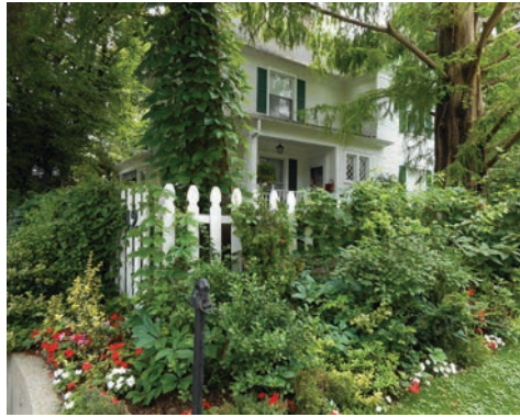
42 W. Siebenthaler Ave.

Last presented in the 1980s, the City Beautiful Award encourages and recognizes civic pride by acknowledging property owners/occupants who devote extra effort to property beautification and maintenance. Residential, commercial and institutional properties are eligible. Honorees receive a certificate of award presented at a City Commission meeting, a yard sign for display, and recognition in City communications. Properties must meet one or more of the following criteria: aesthetic