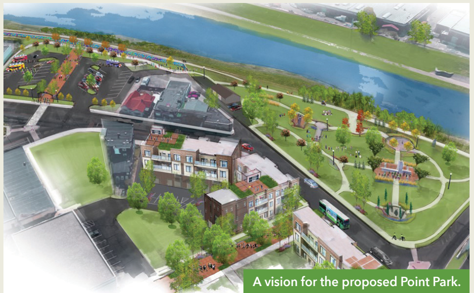
A vision for the proposed Point Park.

The grand opening of the new Dayton Metro Library Southeast Branch (21 Watervliet Ave., adjacent to Belmont High School) will be on Saturday, August 10, from 1 to 4 p.m. Regular service hours will begin on Monday, August 12, at 9:30 a.m. The Belmont and East Branches will close at 6 p.m. on Saturday, July 6, to begin the move to the new location. The old Belmont Branch will reopen with limited services (computers and holds only) from July 10 to 26. For information, go to daytonmetrolibrary.org .