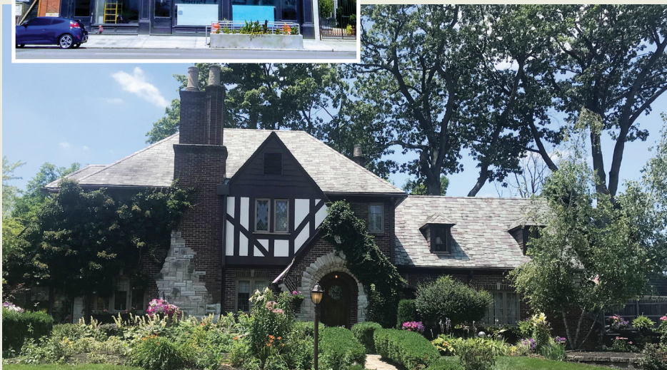
This Dayton View Triangle home on Burroughs Drive is one of five residential properties honored for summer 2019.