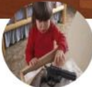
Children and firearms