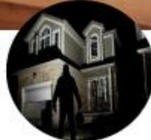
Owning firearms for home security