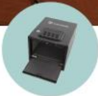
Safe storage of firearms