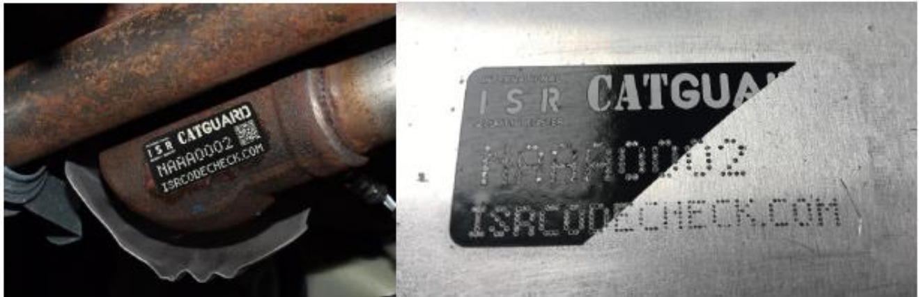
The above photos are sample images of catalytic converter labels produced by RETAINAGROUP – IAATI does not endorse specific products, the above examples are for illustration purposes only.

Even if the label is removed, the etched number information will remain clearly readable for catalytic converter ownership to quickly be verified.