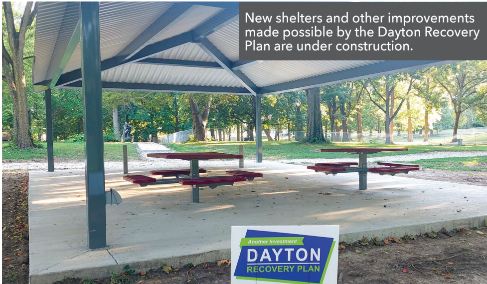
New shelters and other improvements made possible by the Dayton Recovery Plan are under construction.

were supported by a donation from the St. Anne's Hill Historic Society. (See additional Dayton Recovery Plan projects in the "Upcoming in 2024" section).