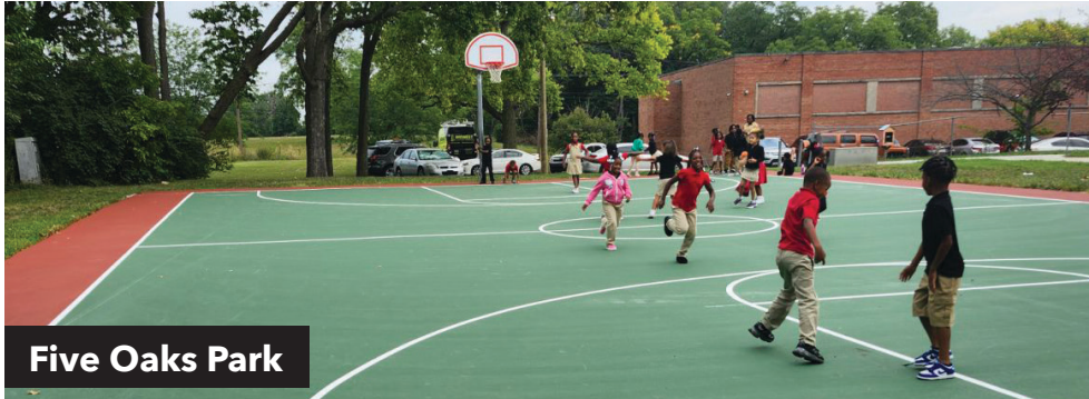
Five Oaks Park

Infrastructure improvements managed by the City of Dayton Dept. of Public Works are modernizing streets, improving safety and enhancing neighborhoods citywide. Major projects are largely funded by federal and state transportation grants (Dayton Recovery Plan funding where indicated).