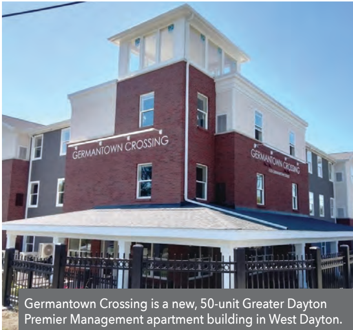
Germantown Crossing is a new, 50-unit Greater Dayton Premier Management apartment building in West Dayton.