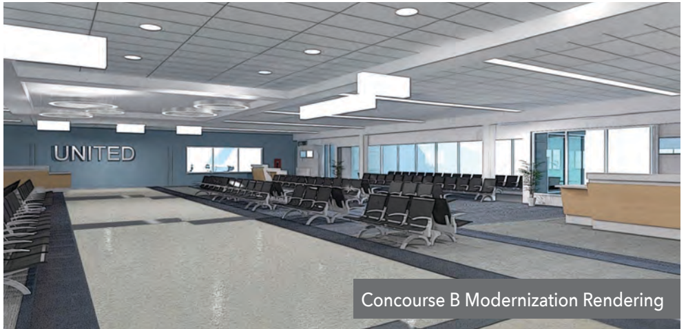
Concourse B Modernization Rendering

Delta Air Lines is adding a fifth daily flight between DAY and Atlanta's