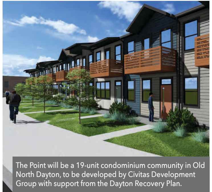
The Point will be a 19-unit condominium community in Old North Dayton, to be developed by Civitas Development Group with support from the Dayton Recovery Plan.

Since 2021, Dayton has been writing a powerful story of renewal—where public investment and community priorities come together to create lasting change. Through $88.2 million in public investment, the City has helped spark more than $2.1 billion in development, shaping a future built on shared values: revitalized neighborhoods, thriving businesses, and opportunities for all.